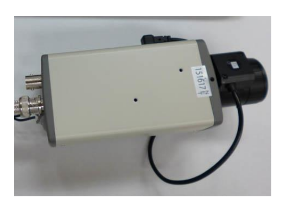
Fig. 2 High sensitivity camera