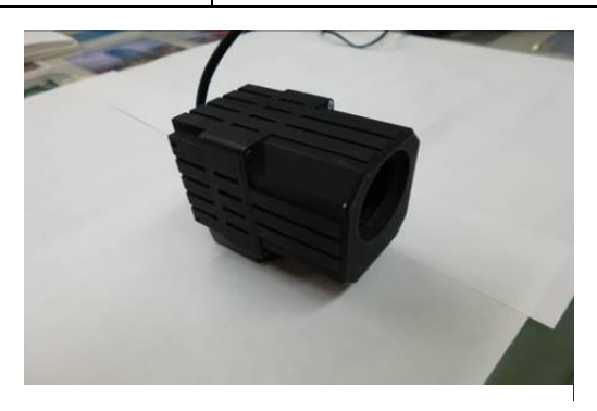
Fig. 1 Far-infrared camera