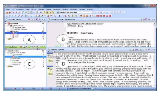
Figure 3: A screenshot of MAXQDA

the data were promptly transcribed from the audio recordings. Verbatim transcription was done, describing moments of silence and the emotional nuances while speaking. From the raw data, we identified common categories using a qualitative data analysis software, MAXQDA, which is widely used to analyze interview data (Figure 3).