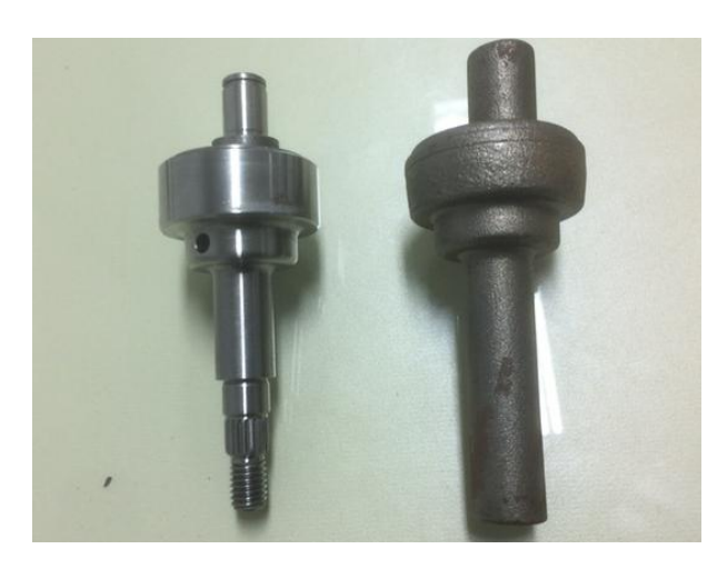
Figure 3: Product photos (cold forging, hot forging).