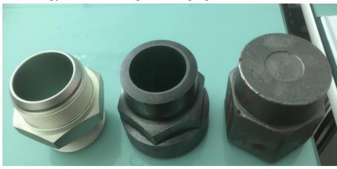
Figure 2: Product photos (cold forging, hot forging).

Thailand. WO, Inc. has more advantages in market strategy and technology than SAMCO, Inc. because they belong to a network of Japanese companies and have wide technology area including cold forging.