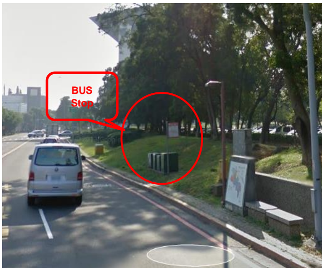
Bus Stop : Guard Creation Rd.2