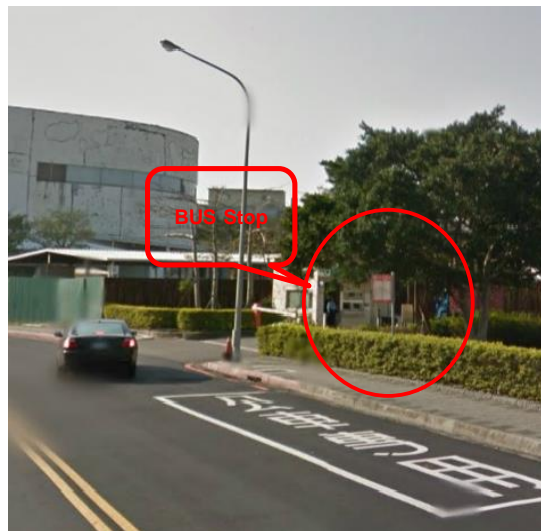
Bus Stop : SPIL